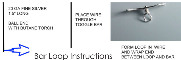
Bar Loop Instructions