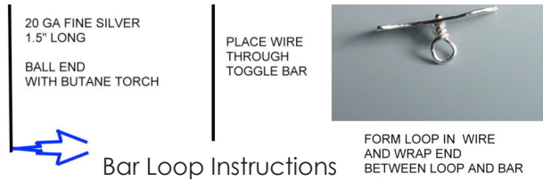
Bar Loop Instructions